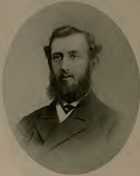
William Winwood Reade.